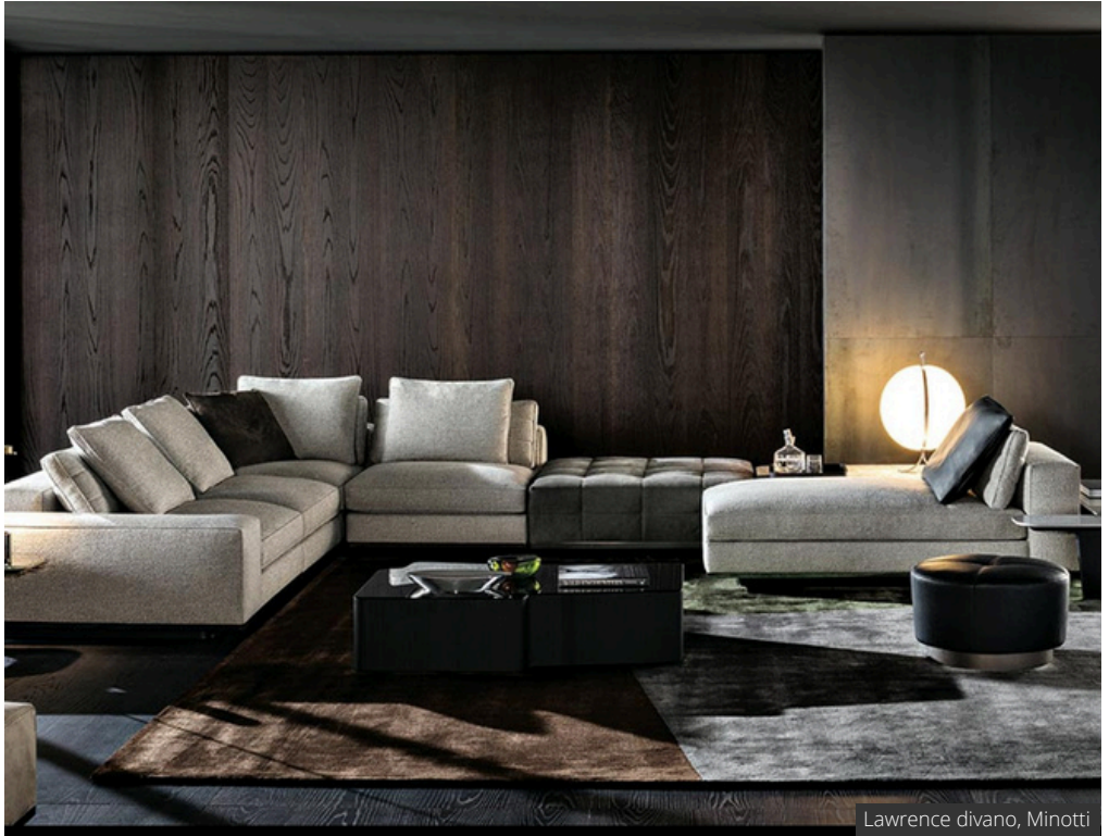
Lawrence divano, Minotti

Benzoville emerges as the exclusive custodian of Olivari's design legacy in India. We take a virtual tour through the opulent showrooms of Benzoville, strategically located to provide design enthusiasts and architects across the country with a tangible experience of Dordoni's creations. The chapter unfolds with vivid descriptions of the meticulously curated displays, showcasing the extensive collection of Olivari door handles in a variety of styles, finishes, and functionalities.