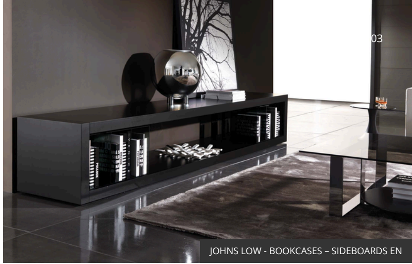
JOHNS LOW - BOOKCASES - SIDEBOARDS EN