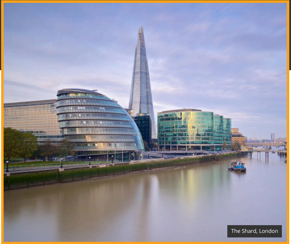
The Shard, London