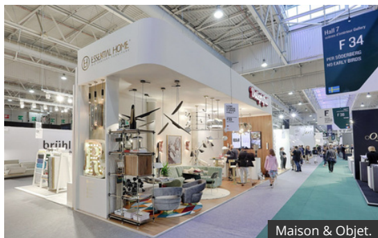
Maison &amp; Objet.